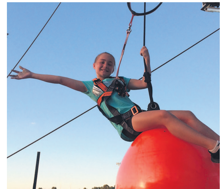
Plenty of action-packed experiences are on offer locally these holidays.

Places are available now! Visit penrith.city/childcare or call 4732 7844.