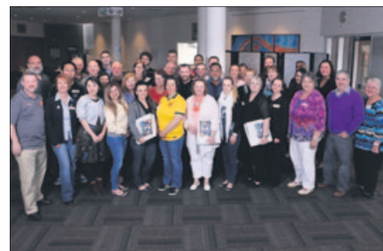
Our last community panel in 2015 considered what services and infrastructure we need in Penrith.

Planning decisions influence the character and identity of our City. We would like your help to guide how we shape Penrith's future. You are invited to register your interest to join a Community Panel to