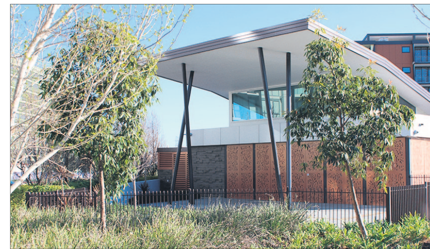
Thornton Community Centre is the newest addition to our range of community centres available for hire.

Are you looking for somewhere to celebrate a birthday or other special occasion, or to hold a workshop or meeting?